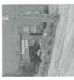
Existing Street Sign