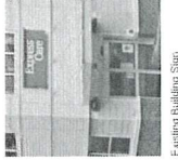
Existing Building Sign