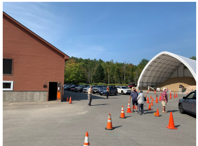
Primary Voting at the Public Works Garage was a BIG success thanks to the cooperation of all!