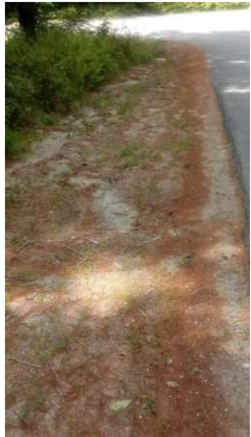
Site Map – Location B – towards County Road