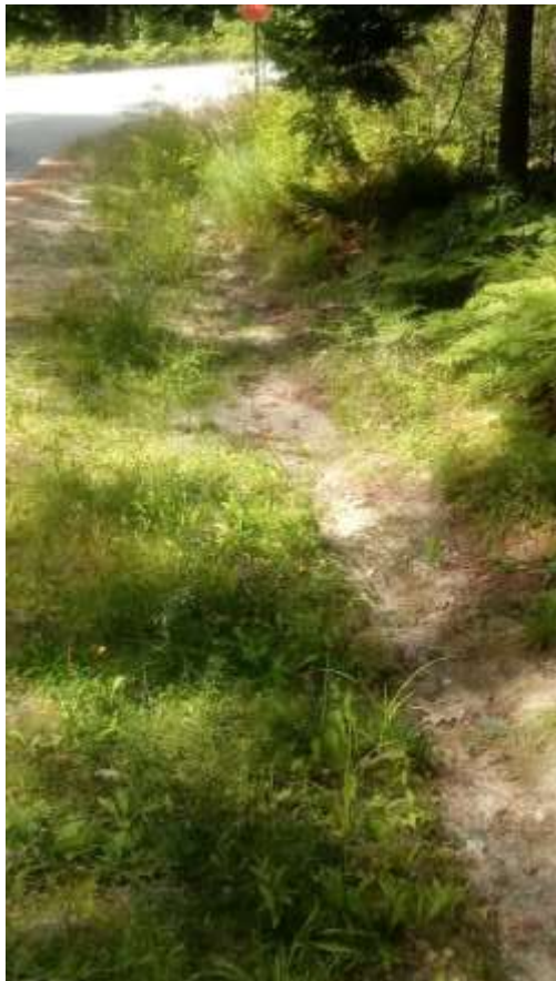
Site Map – Location A – towards County Road