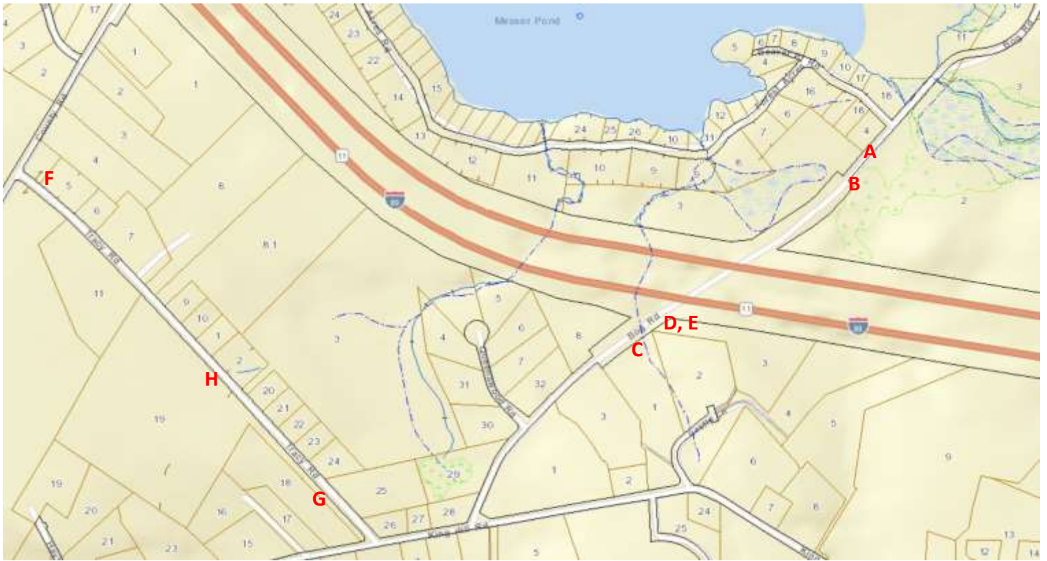
Project Site Map Tracy and Bog Roads