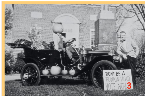
Photo above: Bill Kidder, in this undated photograph from the Town Archives collection, urges voters to vote.