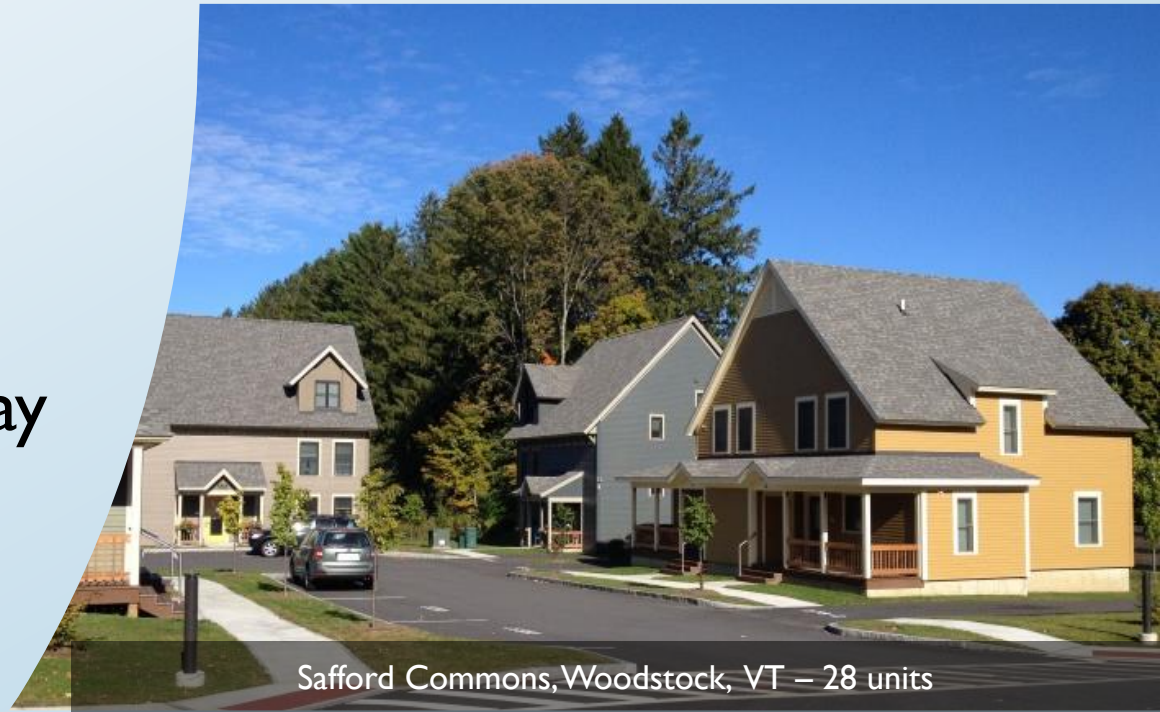
Safford Commons, Woodstock, VT – 28 units