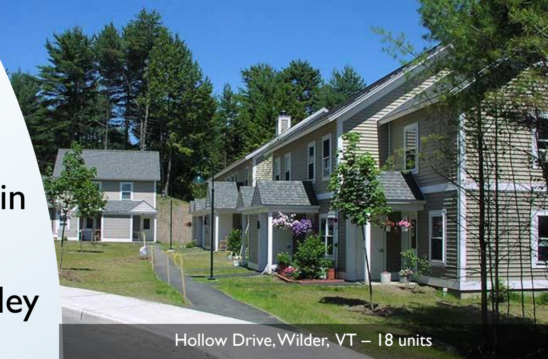
Hollow Drive, Wilder, VT – 18 units