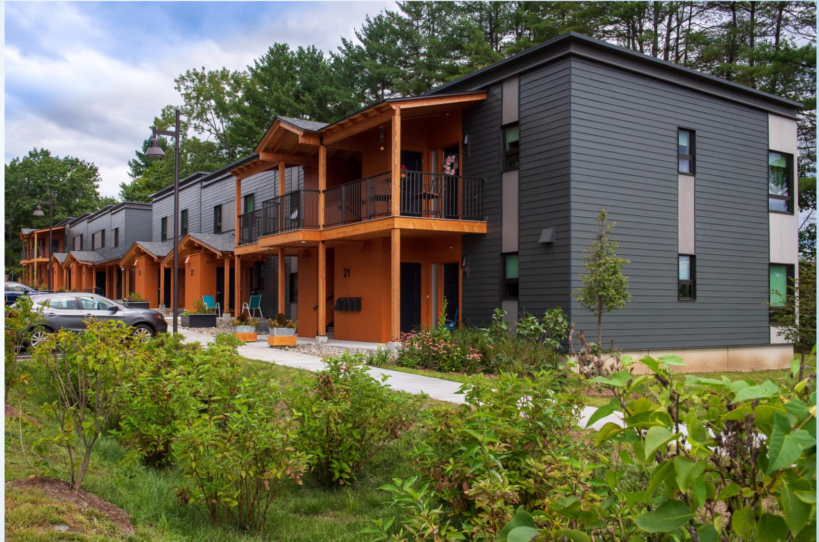
Safford Commons, Woodstock